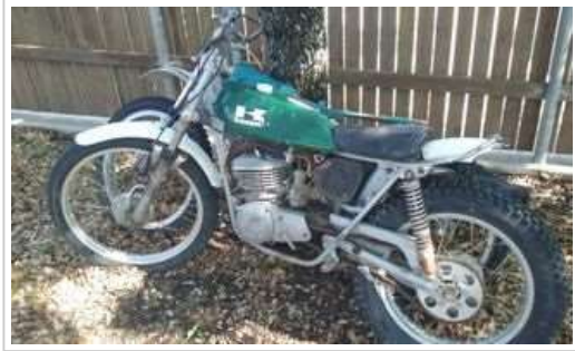
1975 KT250 in Dallas...